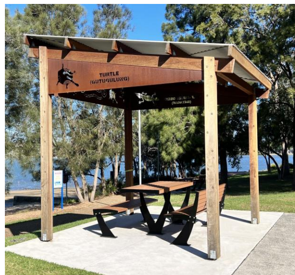
EM529 Timber Shelter with custom spotted gum timber, lasercut corten steel panels and DDA Valletta Setting with composite battens option